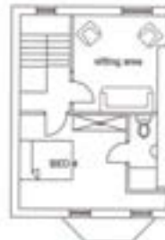
proposed second floor