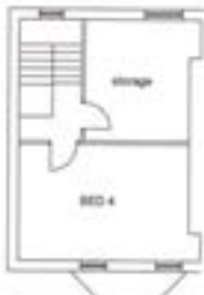
existing second floor