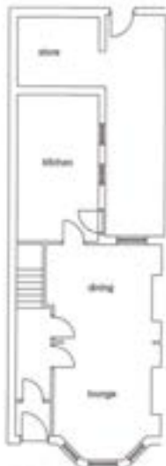
existing ground floor