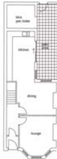
proposed ground floor